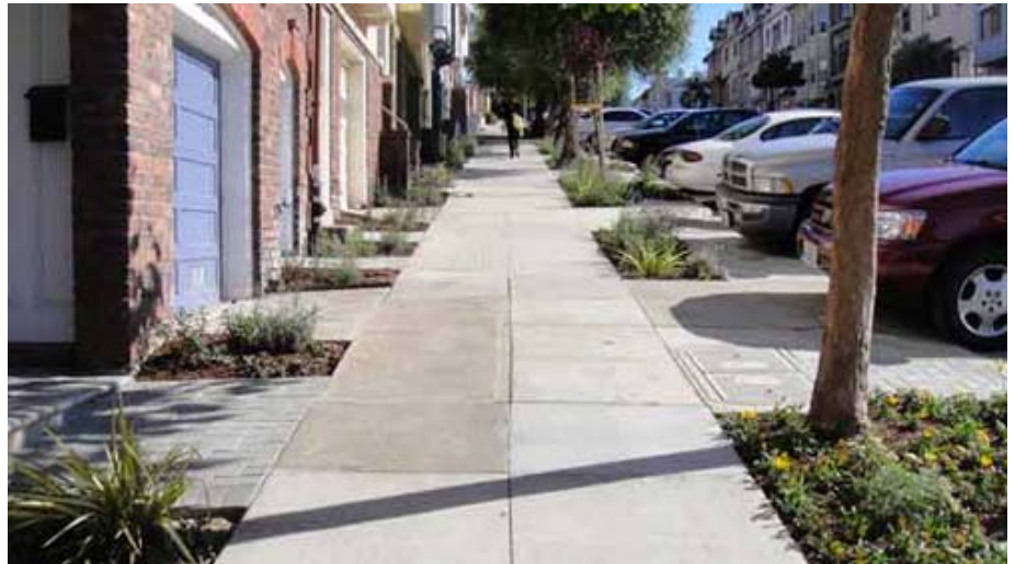
Inner Sunset Stormwater Demonstration Garden 1300 Block of 5 th Avenue - planted July 2010