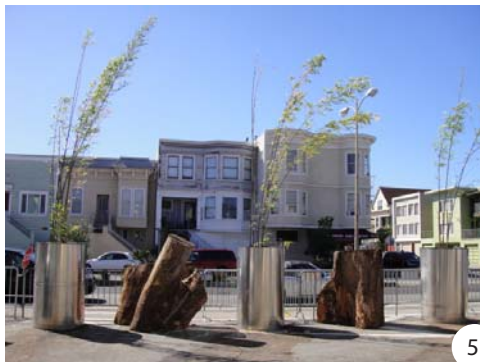
5 Bamboo in cylinder planters & large trunk segments as bollards.

This pedestrian plaza is one in a series of Pavement to Parks projects overseen by the San Francisco Planning Department. The goal is to expeditiously transform excess roadway into park-like spaces for recreation on a temporary trial basis.