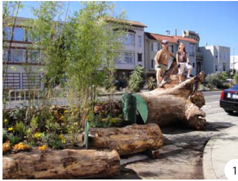
1 Plantings arranged by color; Root ball completes the north end.