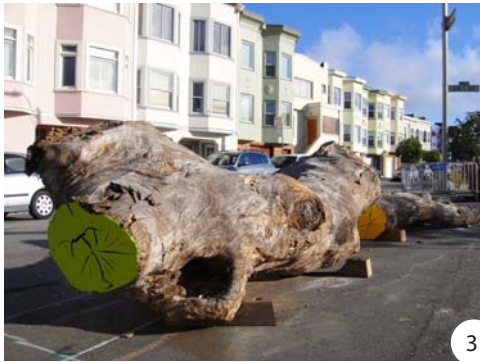
3 The 'Sea Monster' serves as a bollard & offers unstructured play.