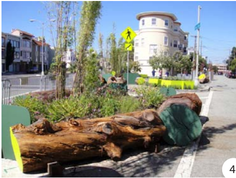
4 Planters are created by felled trees and plywood connectors.