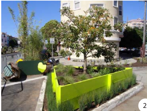
2 Raised in-ground planters feature edible apple trees.